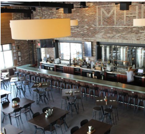
MudHen Brewing Company, Wildwood