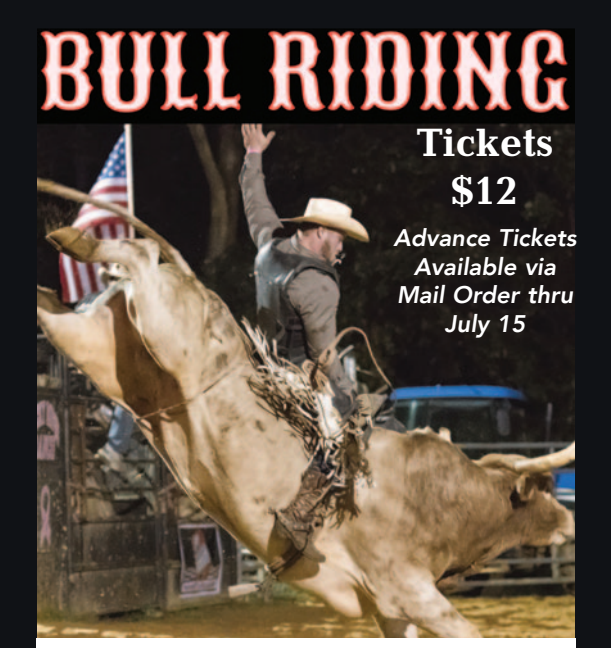
NEW DAY & TIME! Saturday, Aug. 5 3pm Lil' Buckaroos & Mutton Bustin' (show ticket required to participate) 4pm Bull Riding, followed by Barrel Racing

FREE TRACTOR PULLS 7/29, 7/30, 8/1 & 8/2