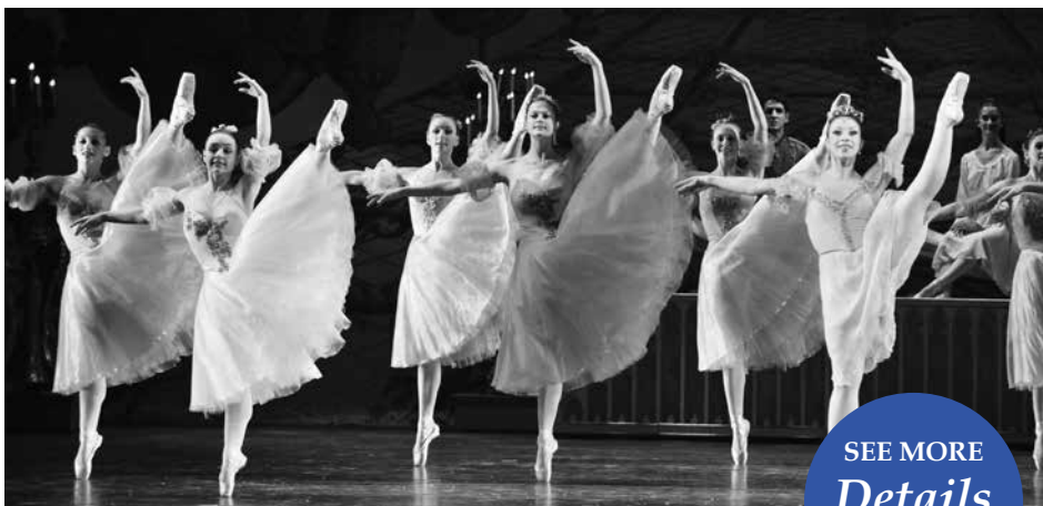
Cover & Above Photo: The Nutcracker , Mayo Performing Arts Center