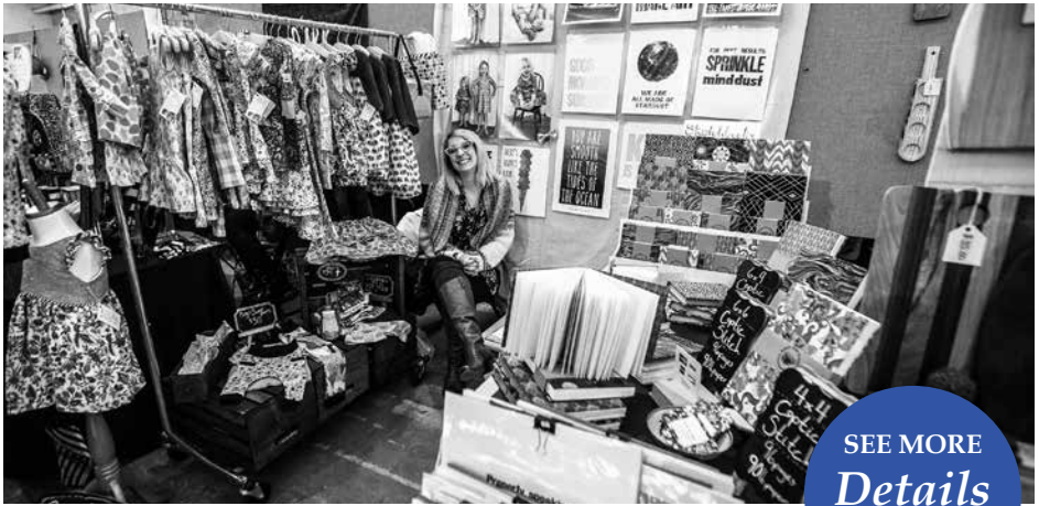
Cover & Above Photo by Jeff Crespi: Trenton Punk Rock Flea Market.